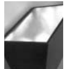
Diffusing glass lens is silicone sealed in canopy to resist moisture and insect infiltration.