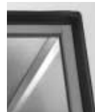
Fixture canopy seals to backplate with quality silicone gasketing.