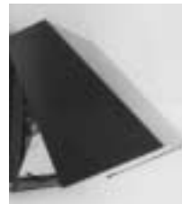
Canopy hinges for lamp or electrical maintenance and easily removes from backplate.