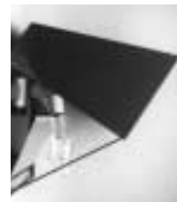
Canopy hinges for lamp or electrical maintenance and easily removes from backplate.